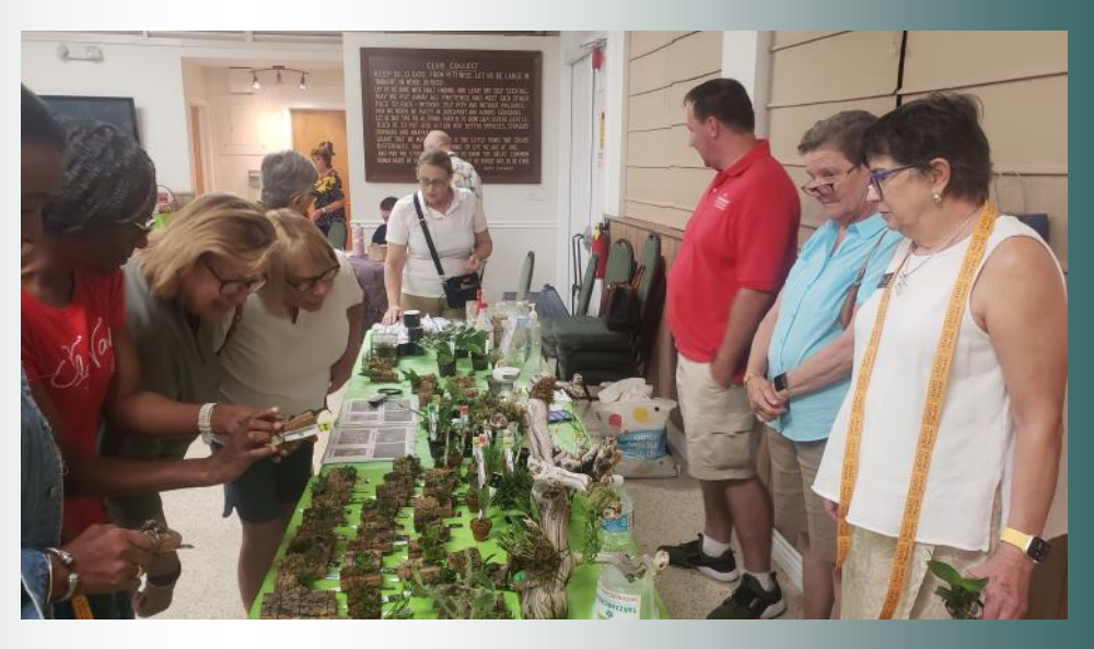
Tarzane Group Miniature Orchid Sales