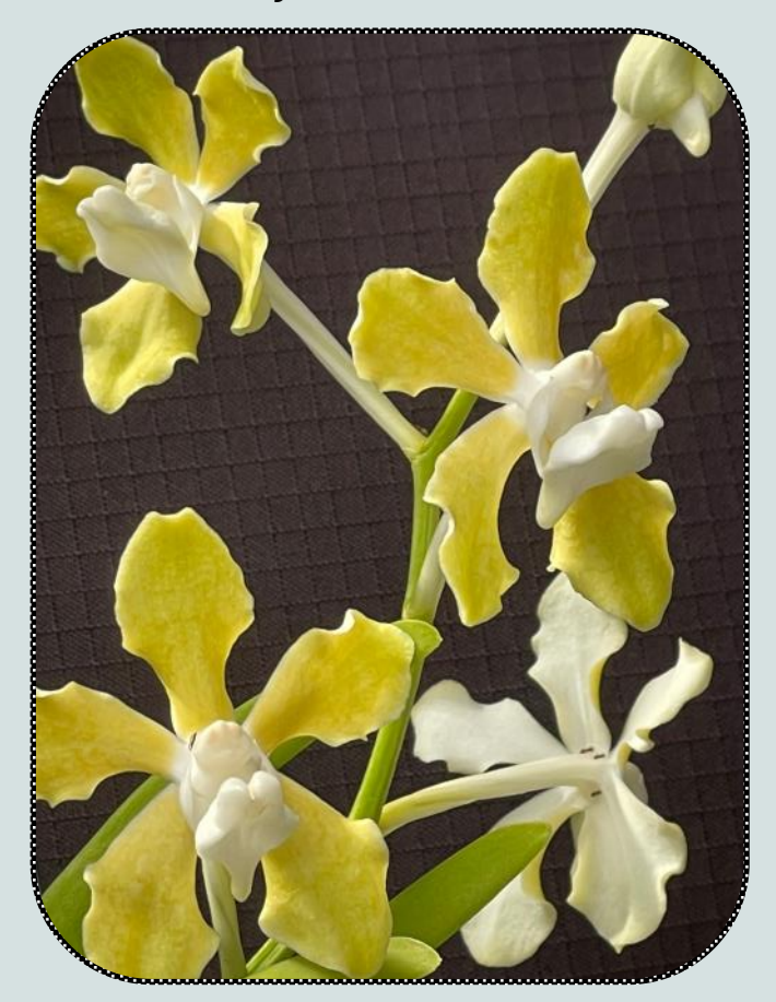
V. tessellata Alba