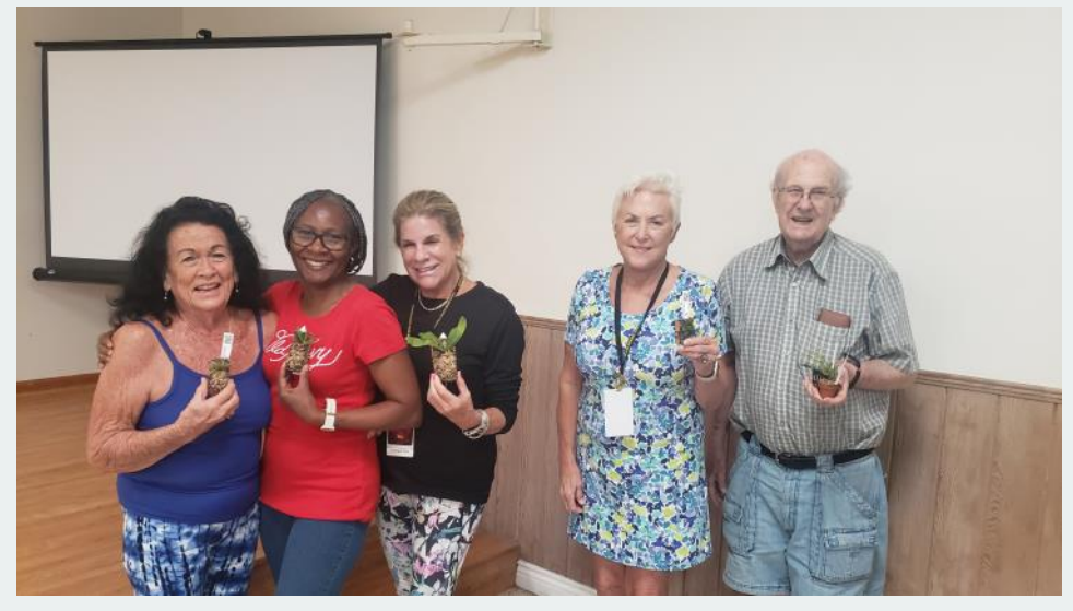
Our Raffle Draw Miniature Orchid Winners Tarzane Group Miniature Orchids