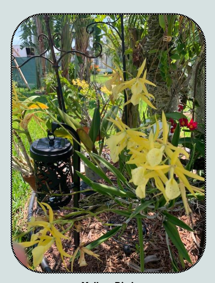
Yellow Bird Grace & Bill Holliday