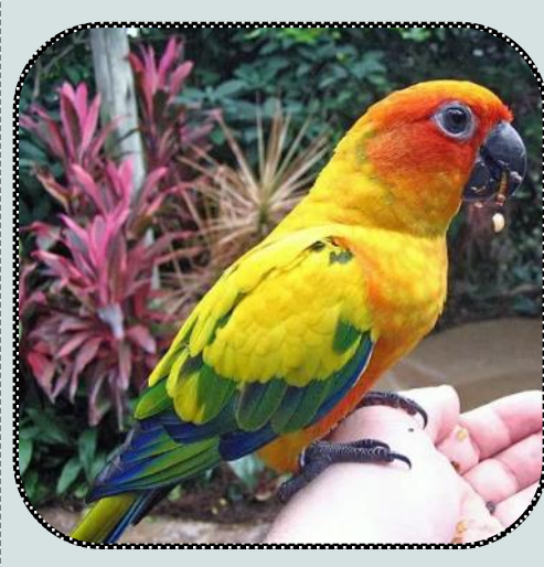
"Sonny" Sun Conure