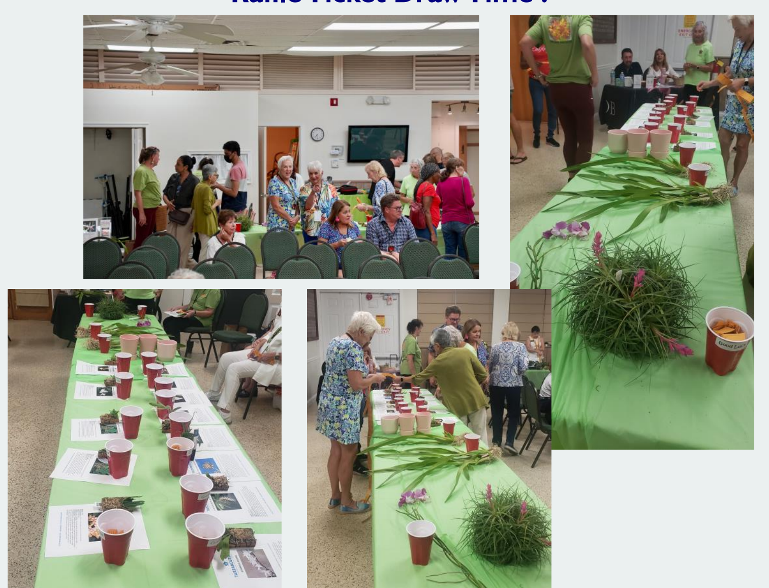
I 3 Miniature Orchids Raffled—looks like only 5 Winners stuck around for Photo Doesn't get you out of requirement to bring in for Judging and show and tell when you get it to bloom though