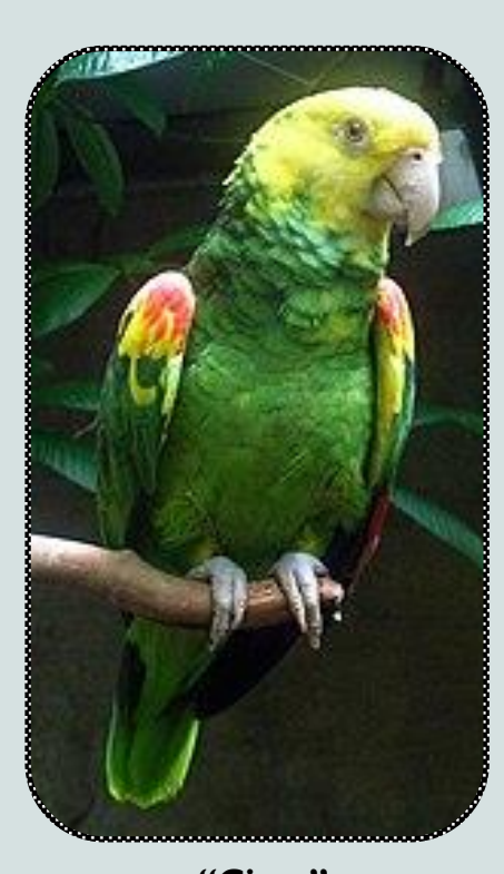
"Cisco" Yellow-headed amazon