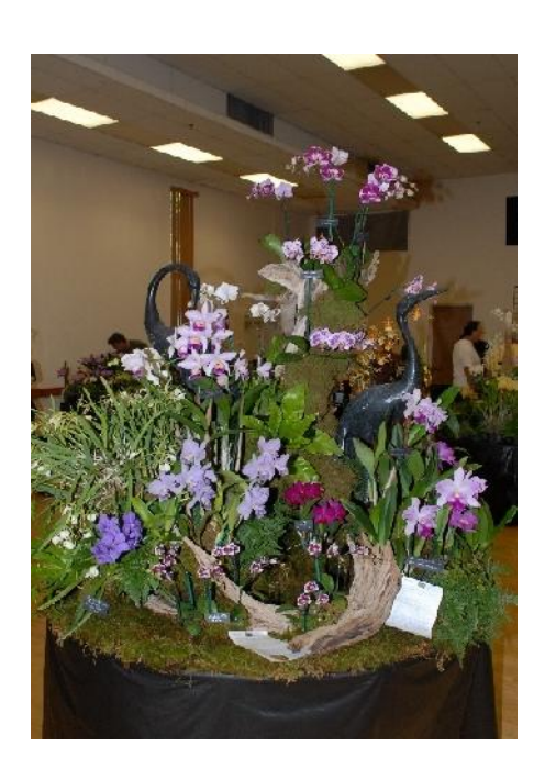
Display AOS Silver Award 86 pts Soroa Orchids