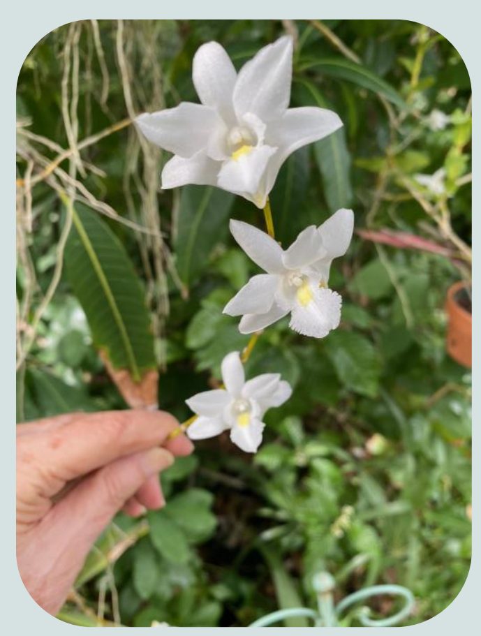
Den. crumenatum