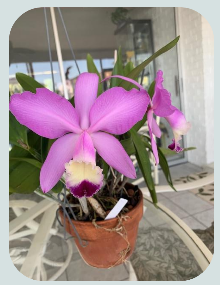
Sweet Sixteen Grace Holliday