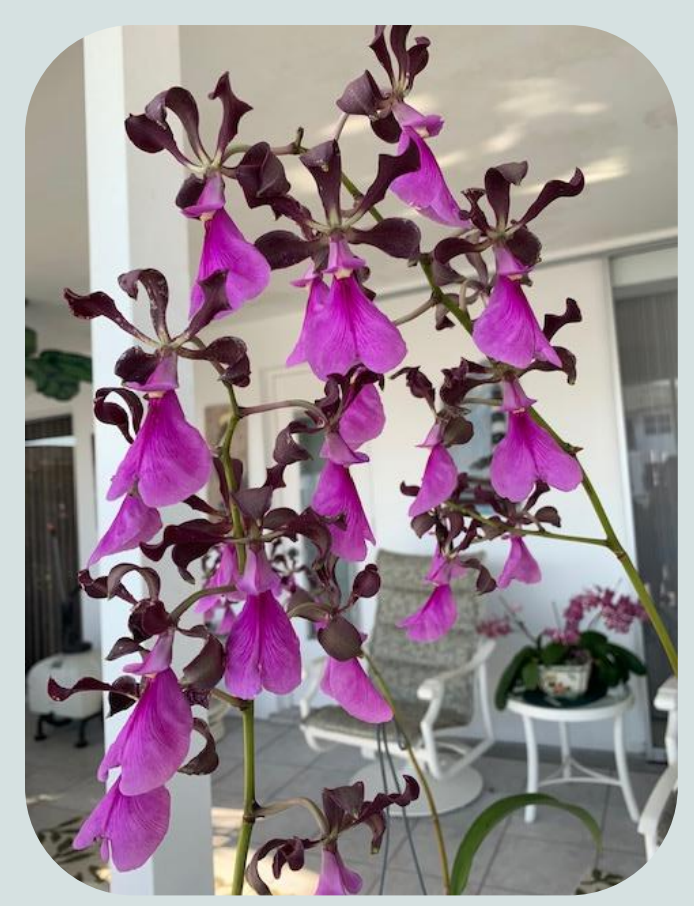
Enc. Cordigera Rosea x Sib Grace Holliday