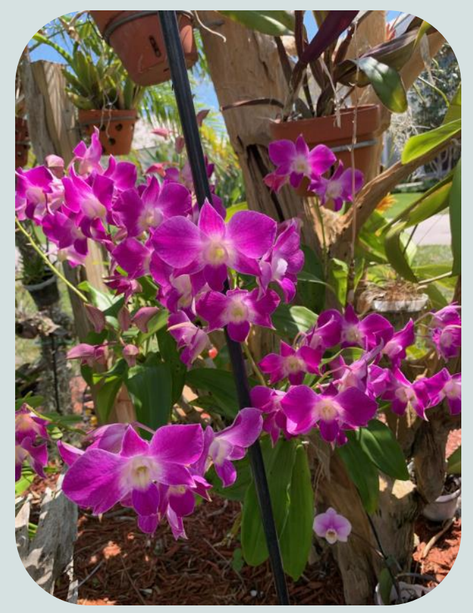
Dendrobium No Id Grace Holliday