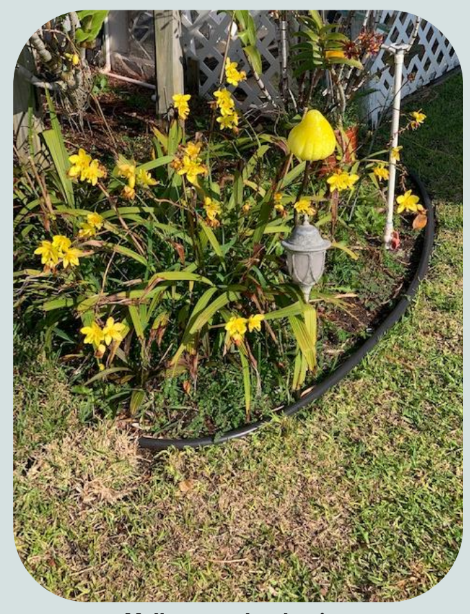
Yellow spathoglottis Grace Holliday