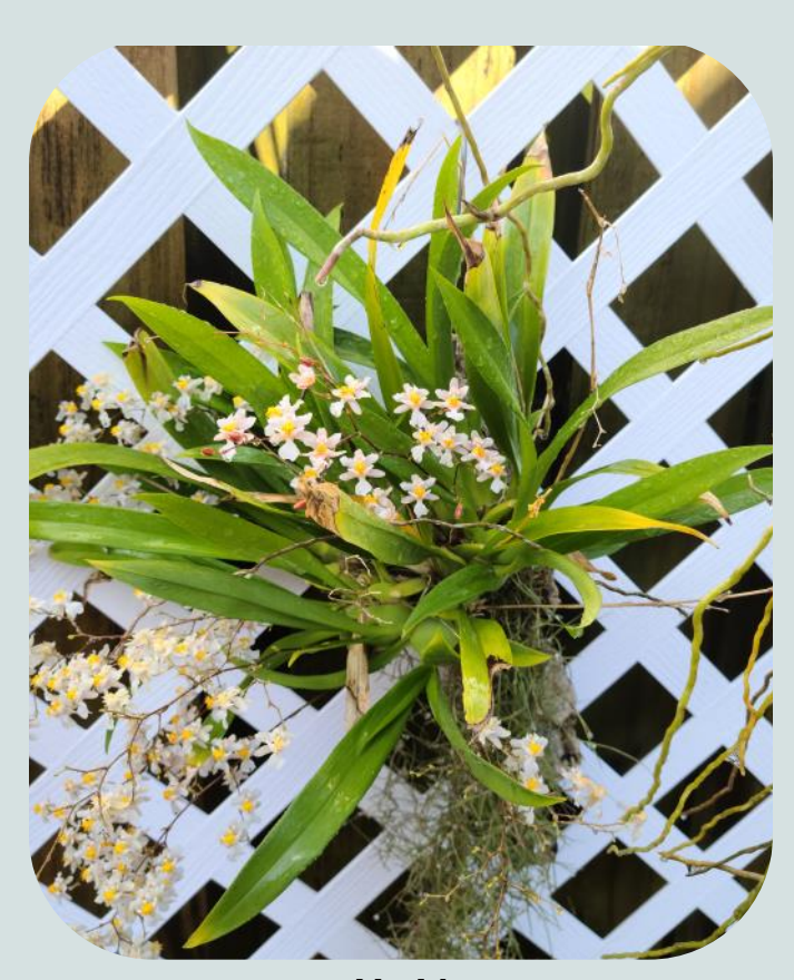
No Id Linda Woodhouse