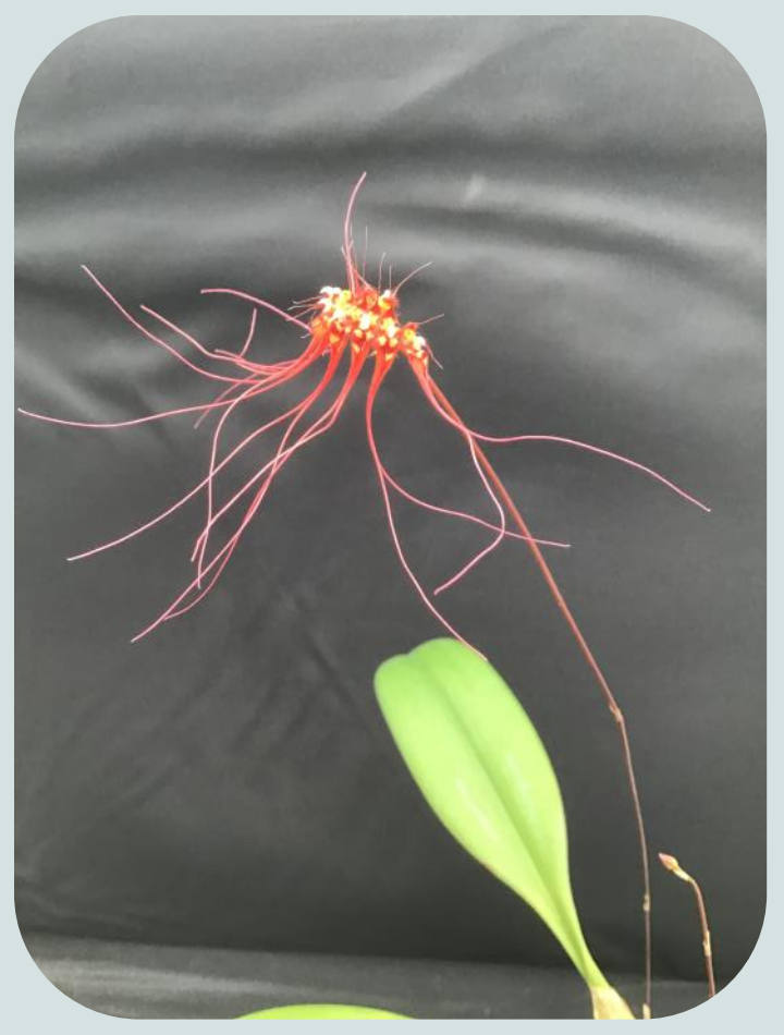
Bulb. gracillimum