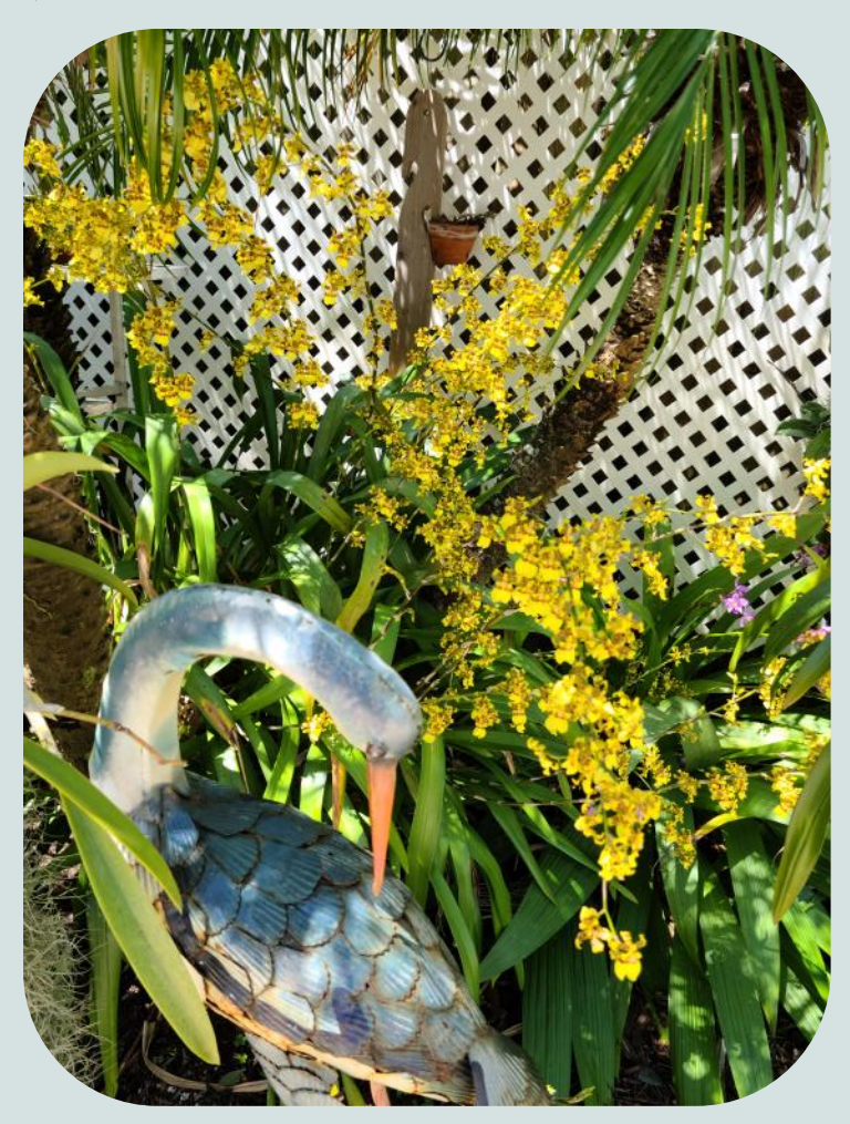
Oncidium sphacelatum Linda Woodhouse