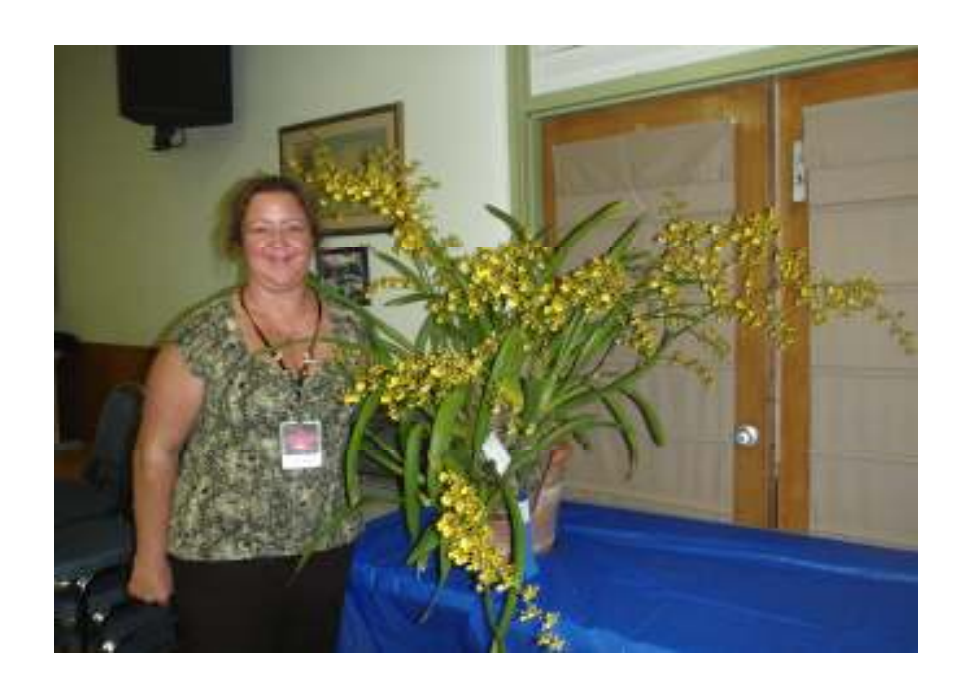
Oncidium Dancing Lady