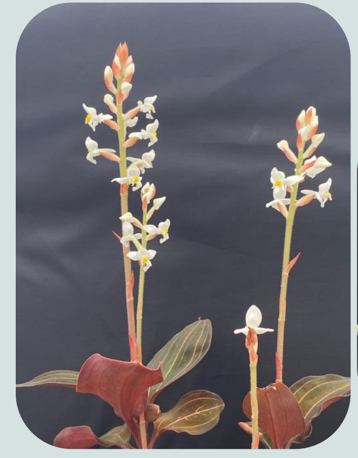
Ludisia discolor