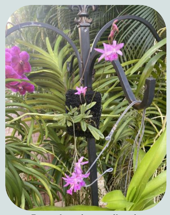
Broughtonia negrilensis