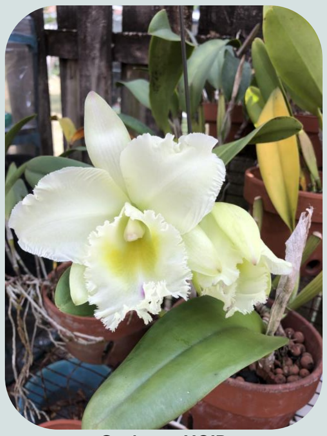
Cattleya NOID Lois Larsen