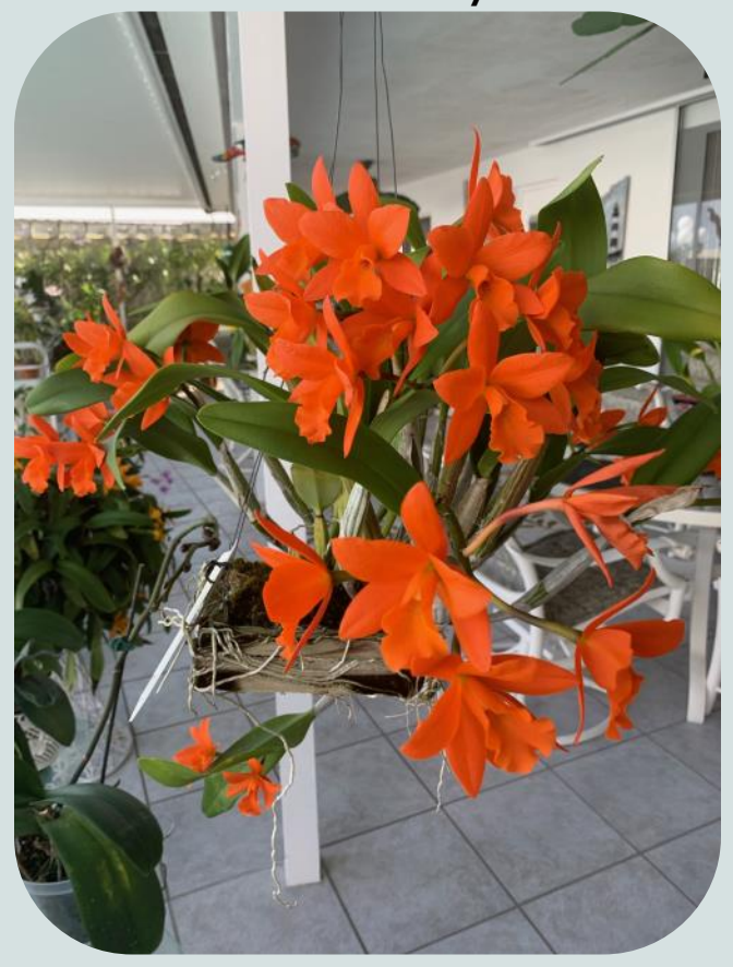
Pot. Love Passion 'Island Romance' Grace Holliday