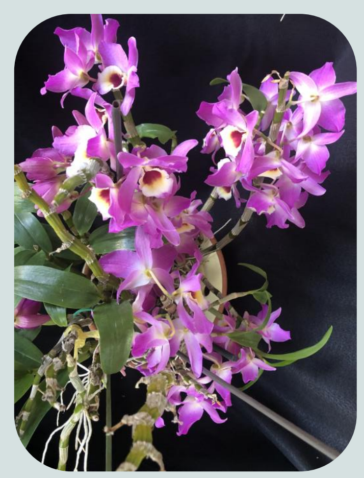
Den. Country Girl 'Warabeuta' Cheryl Babcock