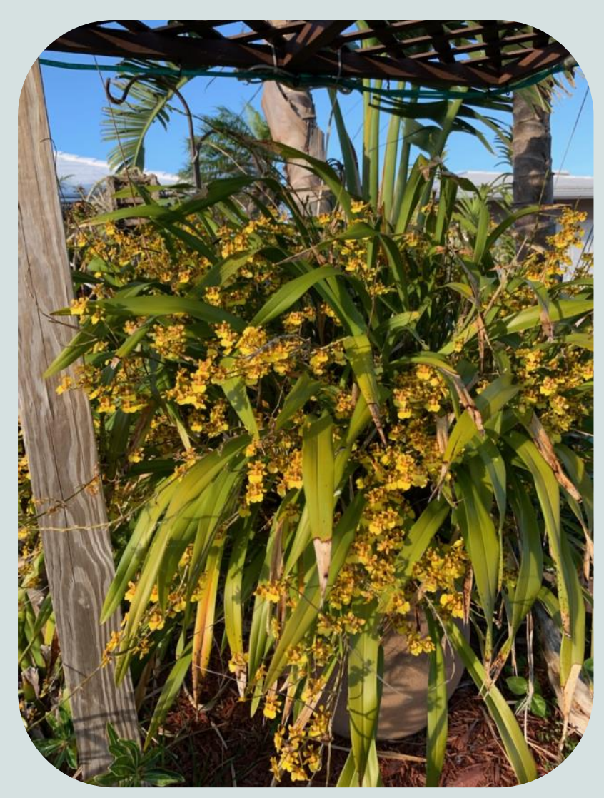
Oncidium sphacelatum Grace Holliday