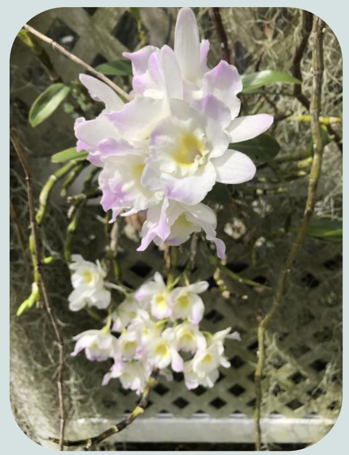
NOID Cheryl Babcock