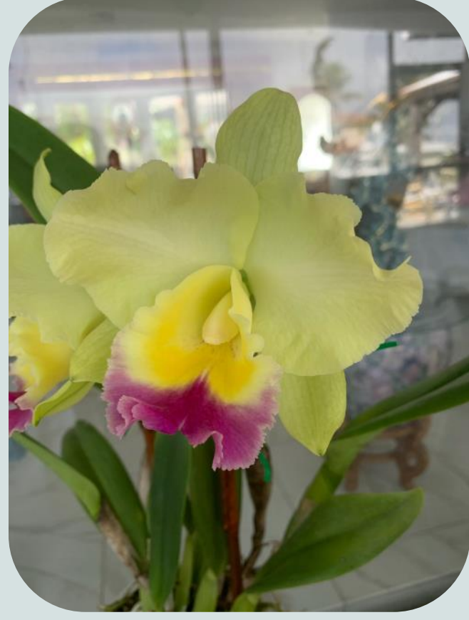
Rlc. Chomthong Delight 'yellow watermelon' Grace Holliday