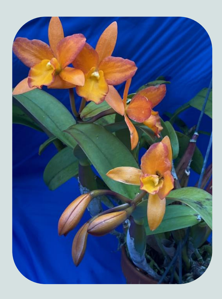
Blc. Fuchs Orange