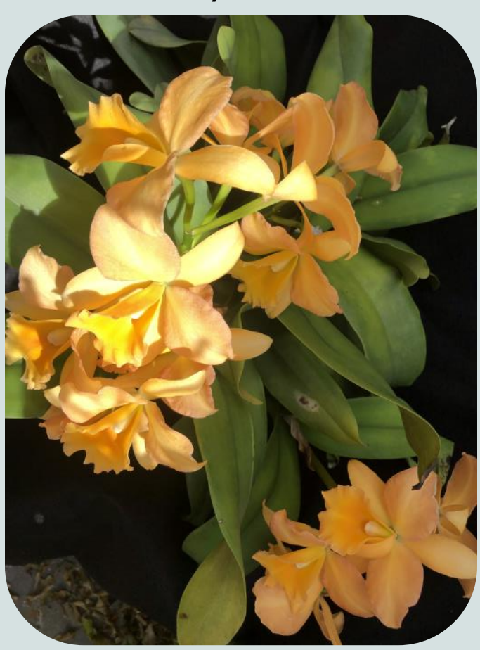
Blc. Bouton D 'CR' NN Cheryl Babcock