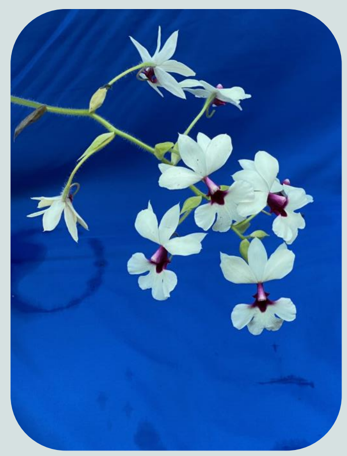
Calathea vestita