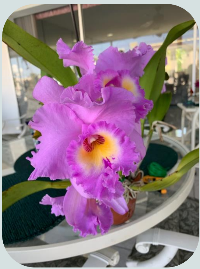
Pot. Love Passion 'Island Romance' Grace Holliday