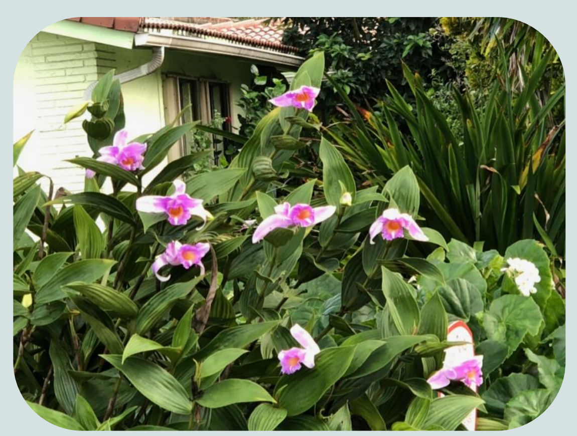
Sobrelia bradeorum