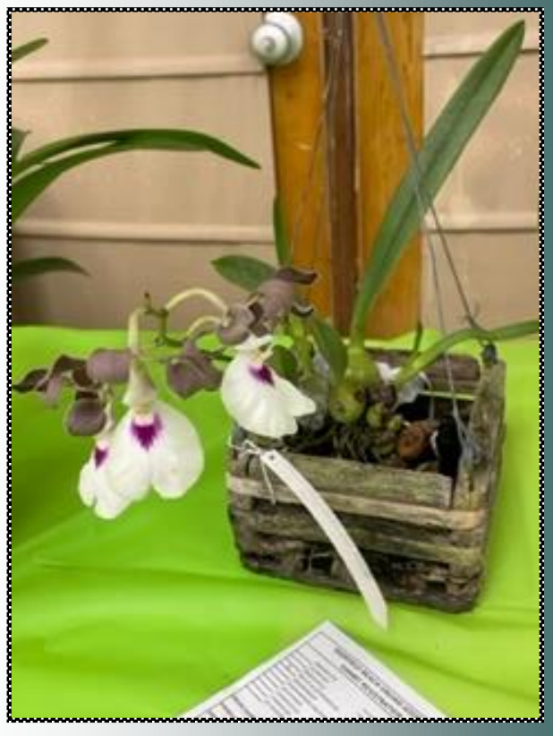
Enc. Cordigera var. Randii