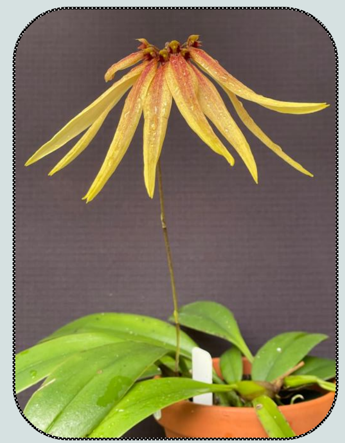
Bulb. zamboangense