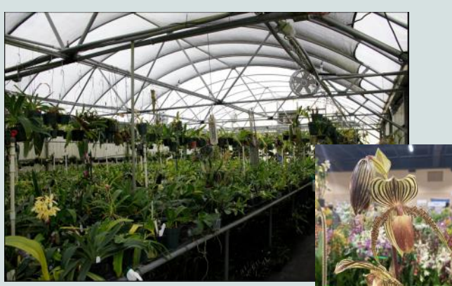
Springwater Orchids Melbourne, Florida