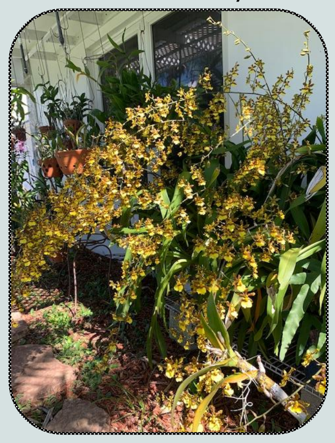
Tropical Breeze Grace and Bill Holliday