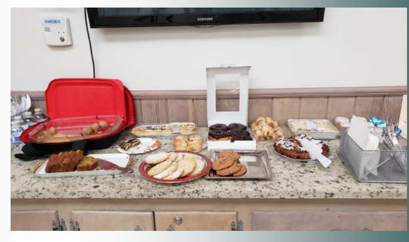
DEBRILD PROCEST OUR DESCRIPTION