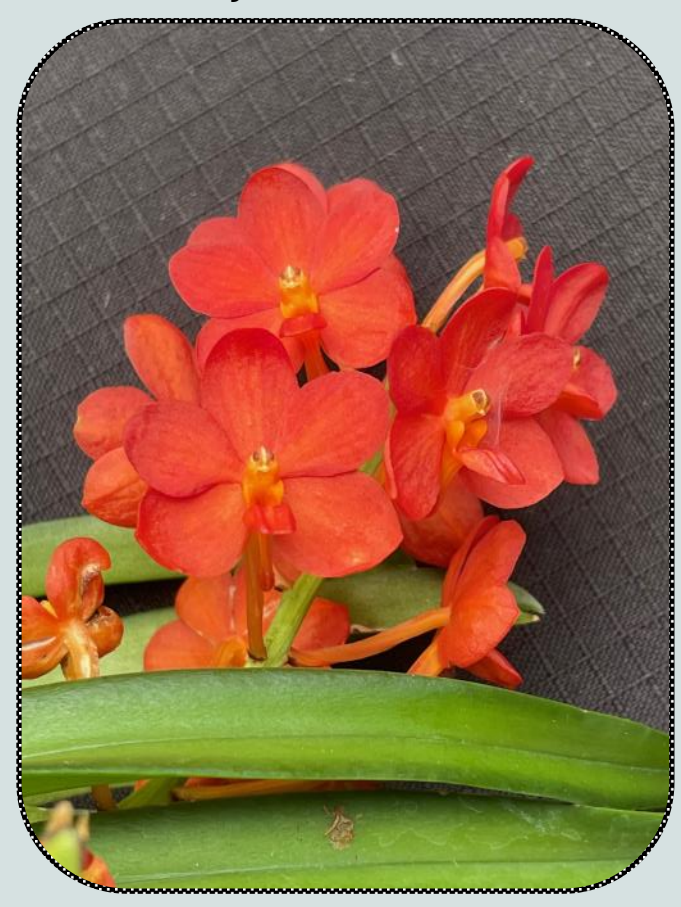
V. Sagarik Gold x V. curvifolia John Pancoast