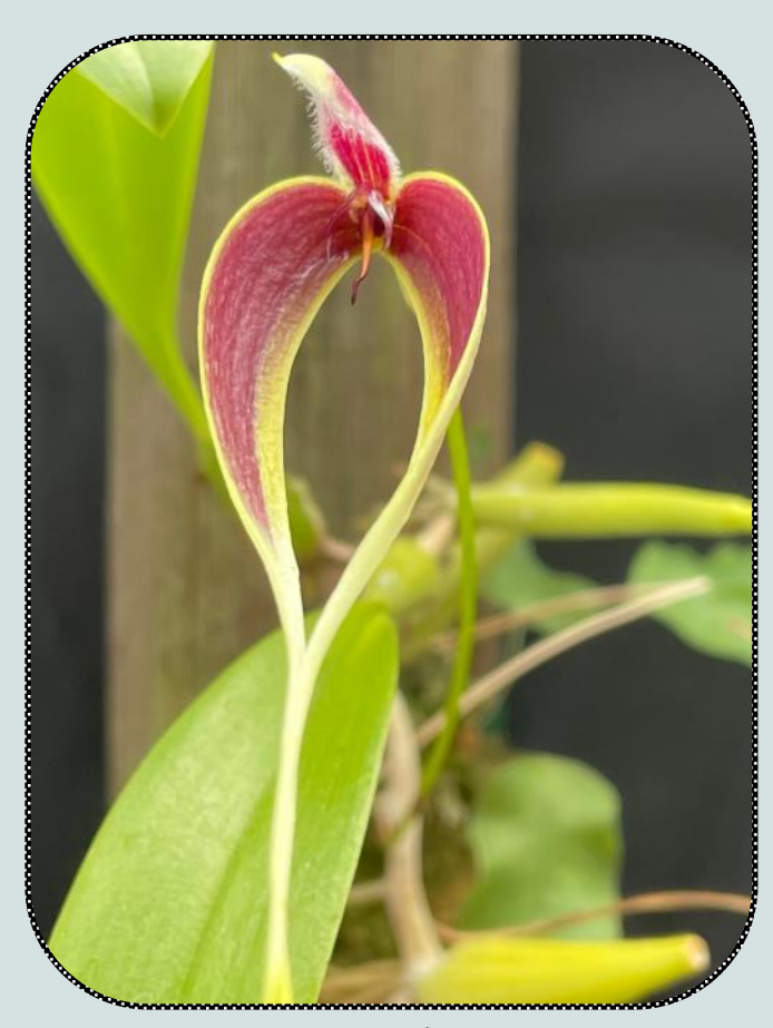
Bulb. maxillare John Pancoast