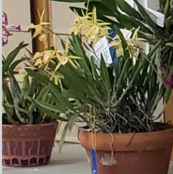
Brassolaelia Yellow Bird BLUE Ribbon Joe Ortlieb & Dennis Pearl