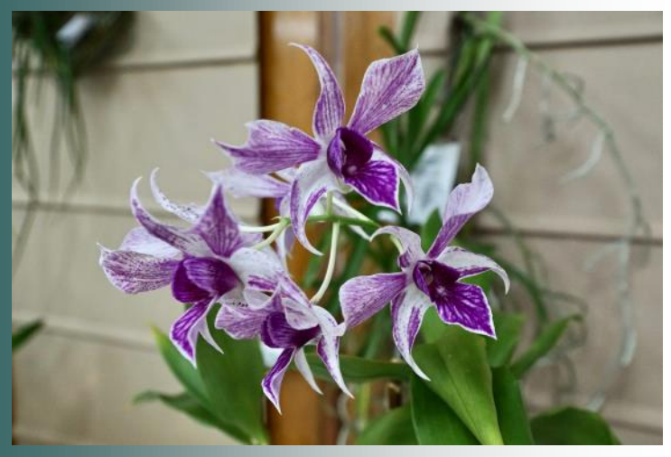
Dendrobium Fire Wings "Oden's Delight" BLUE Ribbon Carol Ott