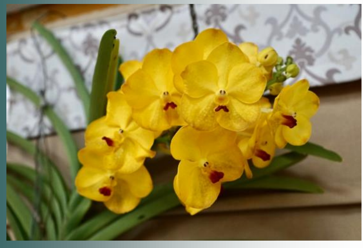
Conference Gold BLUE Ribbon Grace Holliday