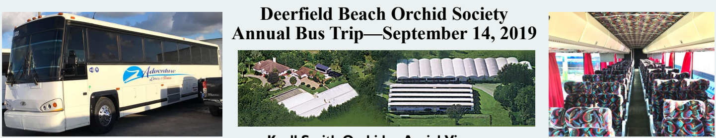
Krull Smith Orchids - Aerial View

Don't forget to sign up for our bus trip September 14, 2019. We will be traveling by luxury coach to R&R Orchids, Odom's Orchids, Krull-Smith Orchids and Ritter Tropic 1 Orchids. We depart the Woman's Club at 7:45AM and return at 9:30PM. The cost is $55.00 per person.