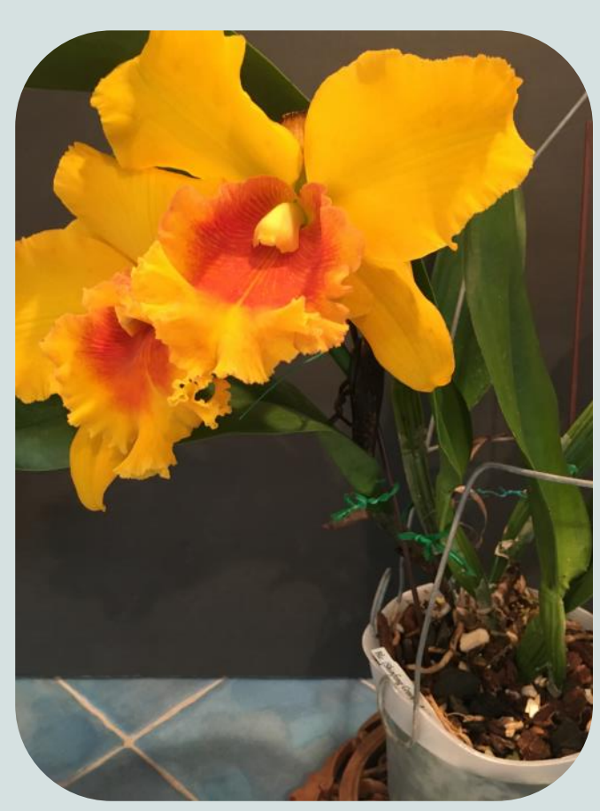
Blc Shinfong Green x Apricot Flare Photo after our class on backdrops Susan Kolinsky