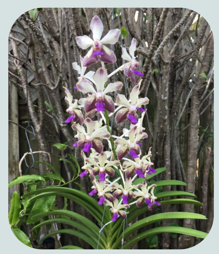
Vanda lamellata X Noi Blue Rhy coelestis Blue Susan Kolinsky