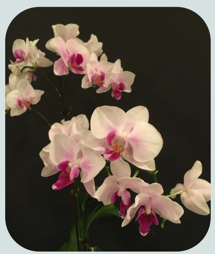
Phalanx NOID Photo after our class on backdrops Susan Kolinsky