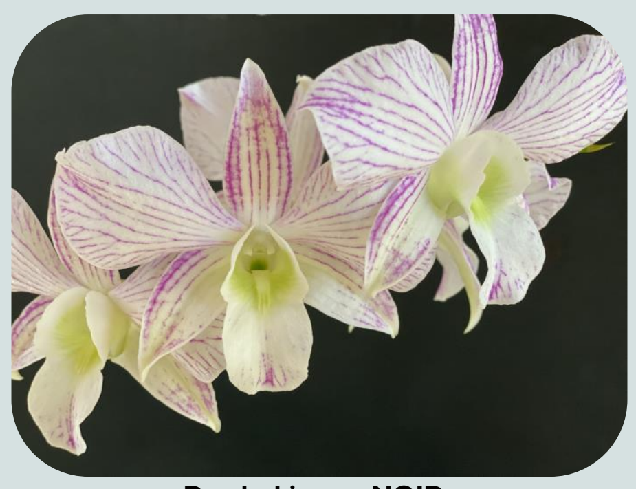
Dendrobium NOID Photo after our class on backdrops Joe Ortlieb & Dennis Pearl