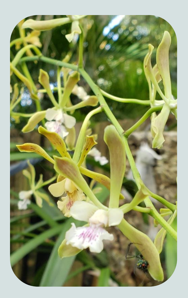
Encyclia Tampensis Ron Franz

and people brought in their blooming orchids to show. We often saw orchids that we put on our list of orchids to add to our collections. If we get enough of our members to submit photos each month, we can have a virtual orchid display. So many of you have commented on FOG or Facebook that you have a beautiful orchid to show and no place to take it.