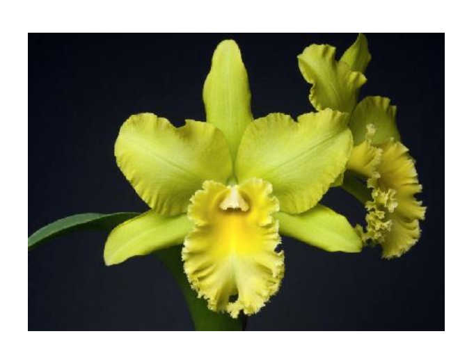
RIc Prada Green Deluxe "Liams Lizard" AM/AOS

Saturday, Jan. 25 10am - 7pm Sunday, Jan. 26 10am - 6pm