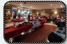
Annual Holiday Party