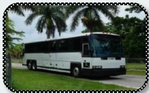
Annual Bus Trip to Growers