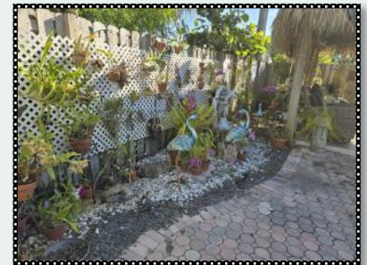
3rd Stop Home of Linda & Nye Woodhouse