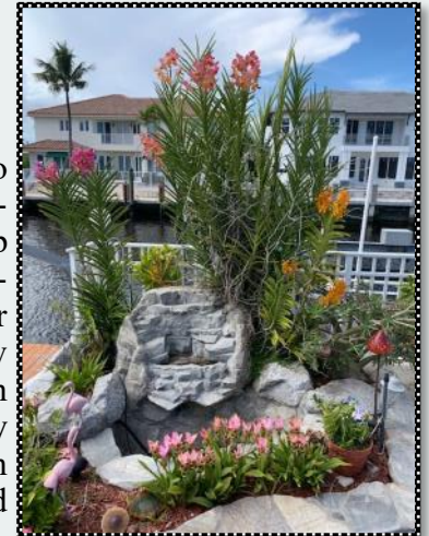
Orchid Fountain Display at 4th Stop Home of Grace Holliday

The ramble is FREE and limited to the first 45 paid members who sign up. Breakfast and Lunch provided. If you are attending the ramble, please bring a main or side dish, salad, appetizer, or dessert. Plan on meeting and parking at the south end of the lot at the Woman's Club at 8:15 am to carpool (leaving at 8:30 am) or meet us at our first stop. Call/ Text Cheryl Babcock at 954-464-8996 to find out what food items we need for the lunch, if you would like to attend and have not previously signed up, or if your plans have changed and you are no longer able to attend. An itinerary will be sent to members who sign up prior to the ramble.