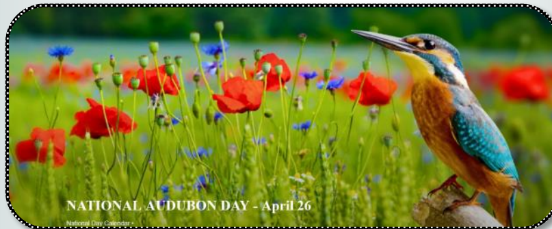
NATIONAL AUDUBON DAY - April 26 National Day Calendar

https://www.nationaldaycalendar.com/national-day/national-sense-of-smell-day-last-saturday-in-april