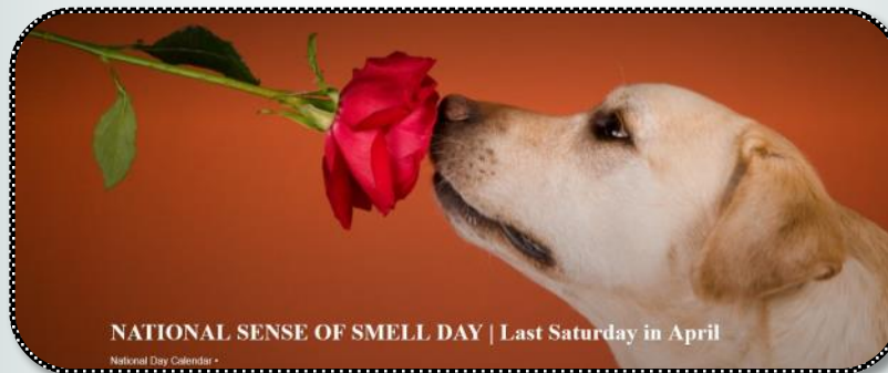
NATIONAL SENSE OF SMELL DAY | Last Saturday in April National Day Calendar

https://www.nationaldaycalendar.com/national-day/national-orchid-day-april-16