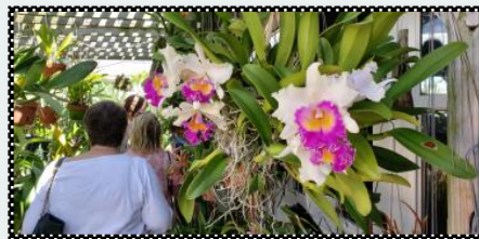
4th Stop Home of Grace Holliday