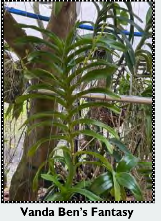
three spikes! and a Kiki!