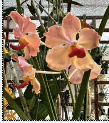
Papilionanda Xishan Mindful 85 (Papilionanda Josephine Van Brero x V. Prayard Muang Ratch)