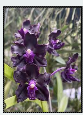
Papilionanda Motes Black Star