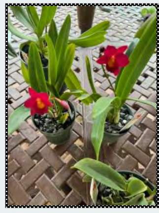
Ctna. Why Not 'Round About' AM/AOS