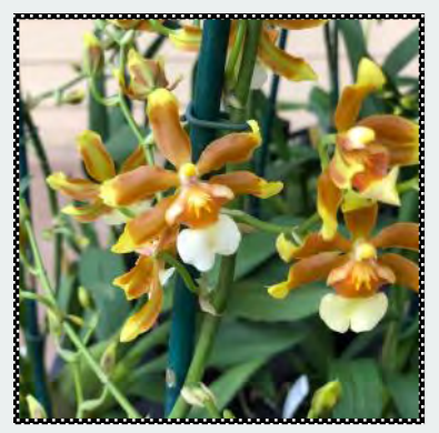
Ons. Hilo Firecracker 'Lucky Strike'