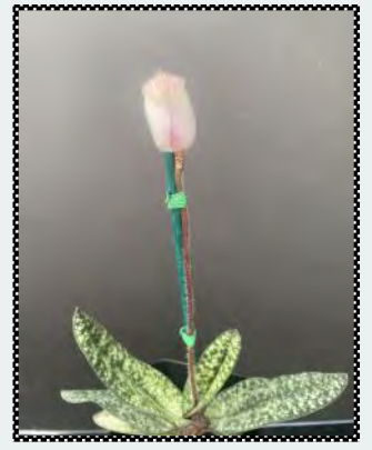
Paph. delenatii ('Regular' x 'Dunkel') Lc. Prism Pallette 'Mischief'