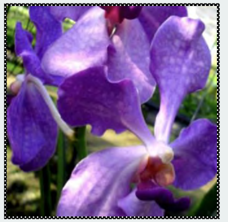
(Paplionanda Josephine Van Brero x Vanda Black Magic)