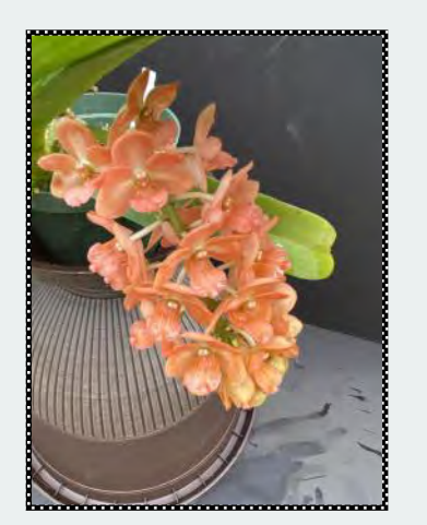
Rhynchostylis Gigantea orange