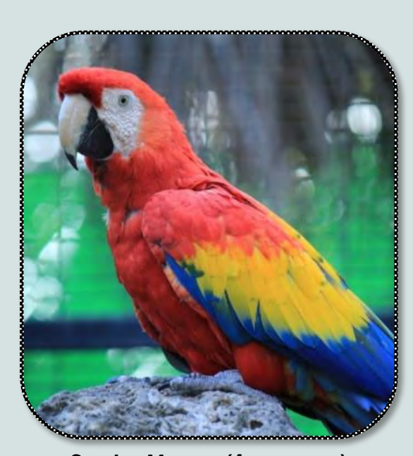
Scarlet Macaw (Ara macao)