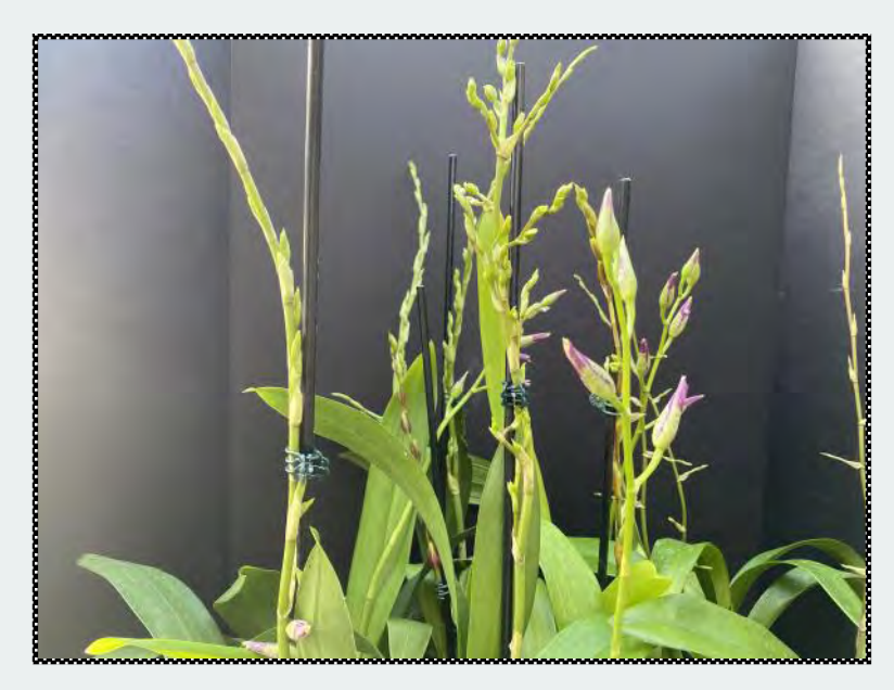
Assorted Dendrobiums and Oncidiums