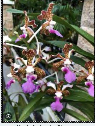
Vanda Ambrosian Discovery (1946 V. tricolor var. suavis x V. Insignis)