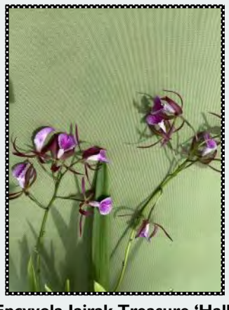
Encyvola Jairak Treasure 'Hallastur'