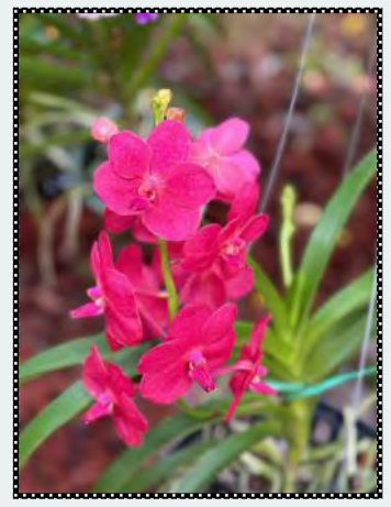
Vanda Wilas x Vanda Dr. Anek two plants in bloom double spike