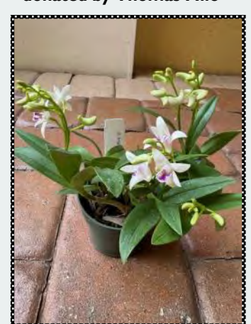
Dendrobium kingianum in assorted colors