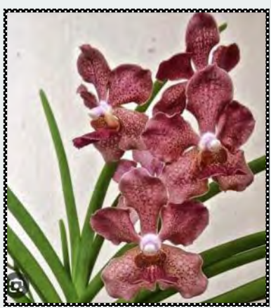
Papilionanda Wong Poh Nee (Pda. Josephine Van Brero x Vanda tessellata)