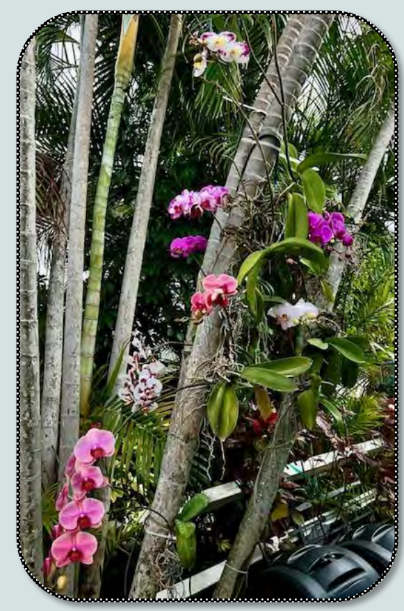
Phals. in landscape growing on trees Linda & Andy Kamm