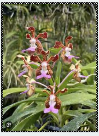
Vanda Motes Multiverse (2678)