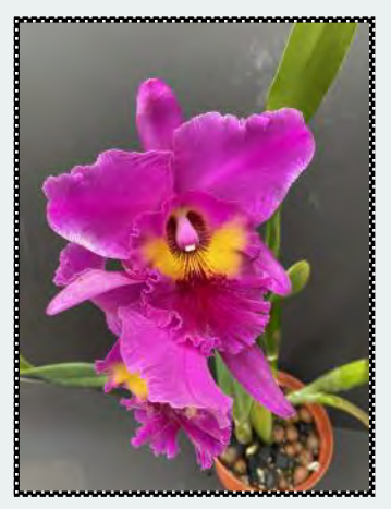
Blc. King of Taiwan 'Ta-Hsin'