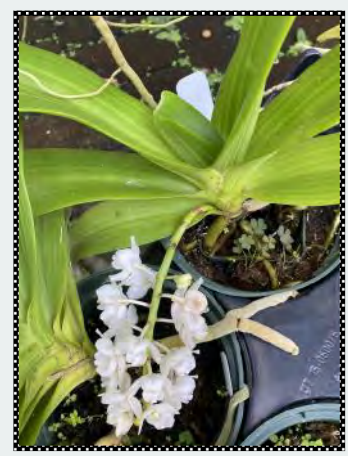
Rhynchostylis Gigantea alba