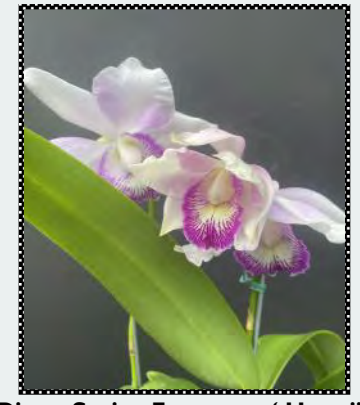
Diaca. Spring Fragrance 'Hawaii'