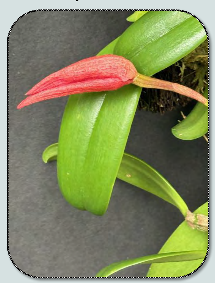
Bulb. fraudulentum