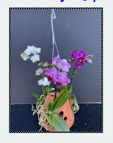
Phalaenopsis Mounted Hanging Clay Pots