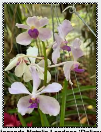
Papilionanda Natalia Londono 'Delicado'