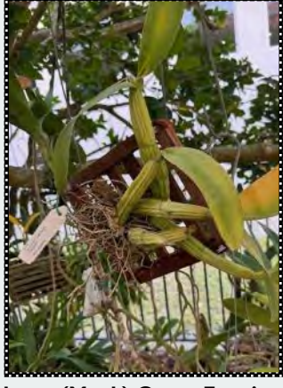
Schom. (Mcpl.) Quest Fangito donated by Quest Orchids