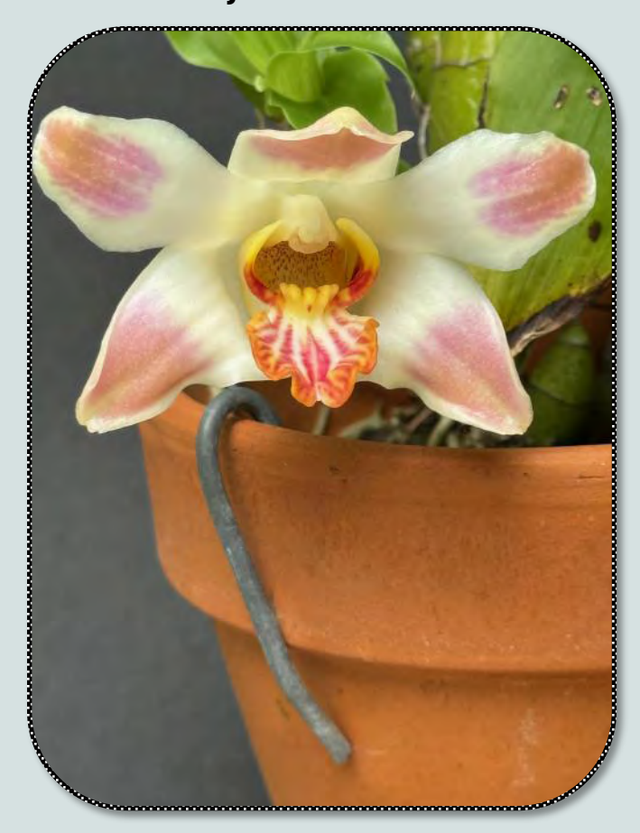
Chysis limminghei