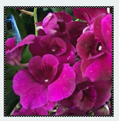
Den. Round Red