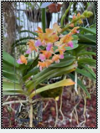
(Aerides houlletiana x Rhyncharoides Bangkok Sunset)