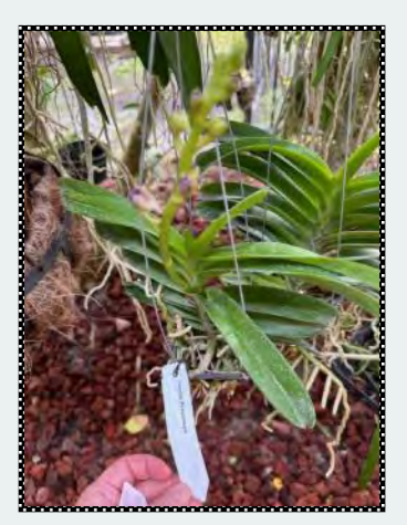
Vanda Prapawan multiple plants in spike