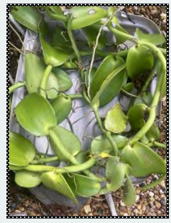
Multiple 4-5 foot cuttings of Vanilla donated by Cheryl Babcock