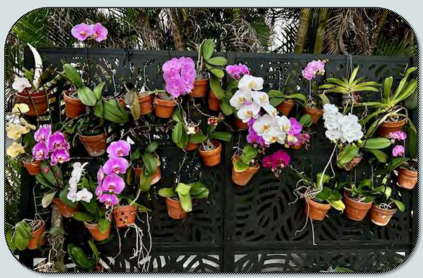
Phalaenopsis in landscape growing on decorative fence Linda & Andy Kamm