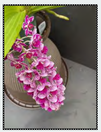
Rhynchostylis Gigantea spot