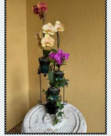
Three-tiered Phal. arrangement