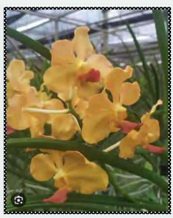
(Papilionanda Josephine Van Brero x Papilionanda Prapathom Gold)