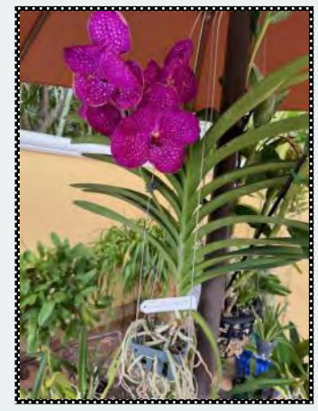
Vanda Thai Ruby x Vanda Black Ball donated by Quest Orchids