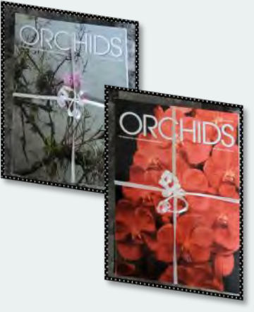
AOS Magazine Back Issue Bundles 12 bundles by year donated by Kathy Octavio