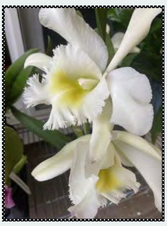
Blc. Pamela x Blc. Aristocrat