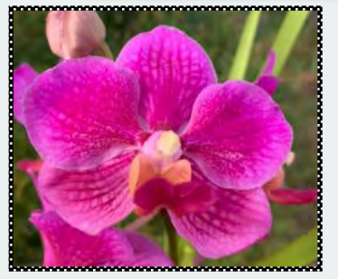
Papilionanda Chao Praya Delight donated by Motes Orchids x 3 orchids