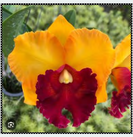
RIc. Pattra Delight - two plants donated by Quest Orchids