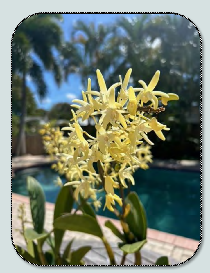
Dendrobium speciosum species Charlie Rowell