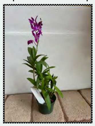
Dendrobium kingianum Assorted colors