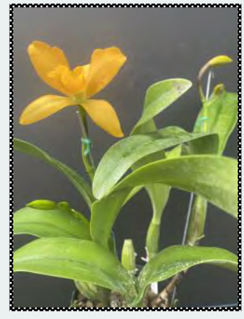
Blc. Carolina Golden D'or x Lc. Gold Digger 'Orglade's Mandarin'