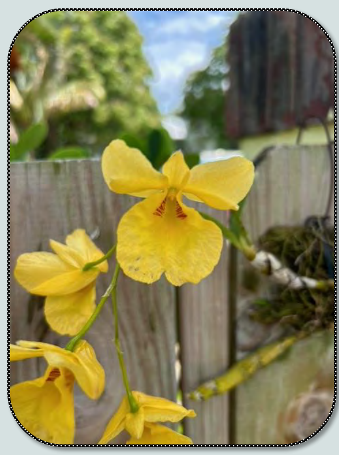
Dendrobium Golden Aya