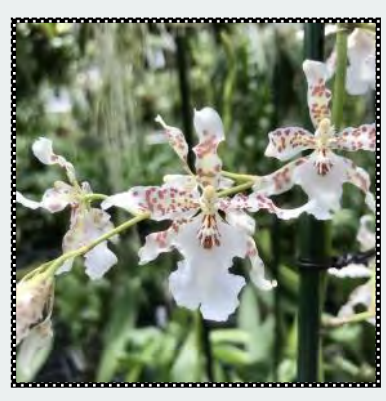
Onc. Speckled Spire 'Snowflake'