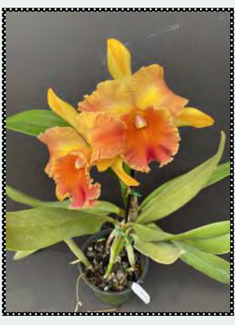
Rlc. Amazing Thailand