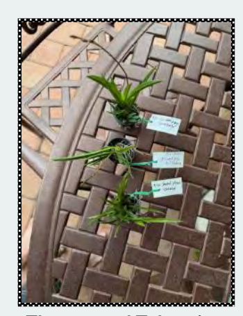
Three named Tolumnias in spike