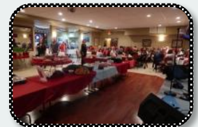
Annual Holiday Party