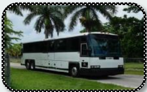
Annual Bus Trip to Growers