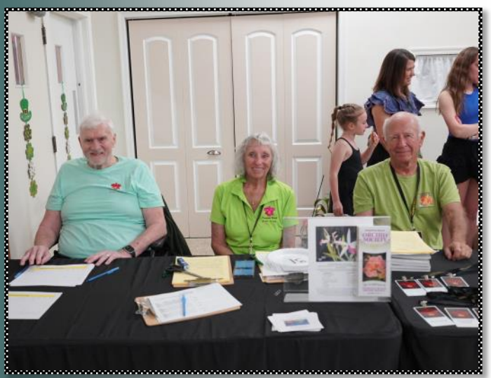
Auction Registration Sign-in Desk