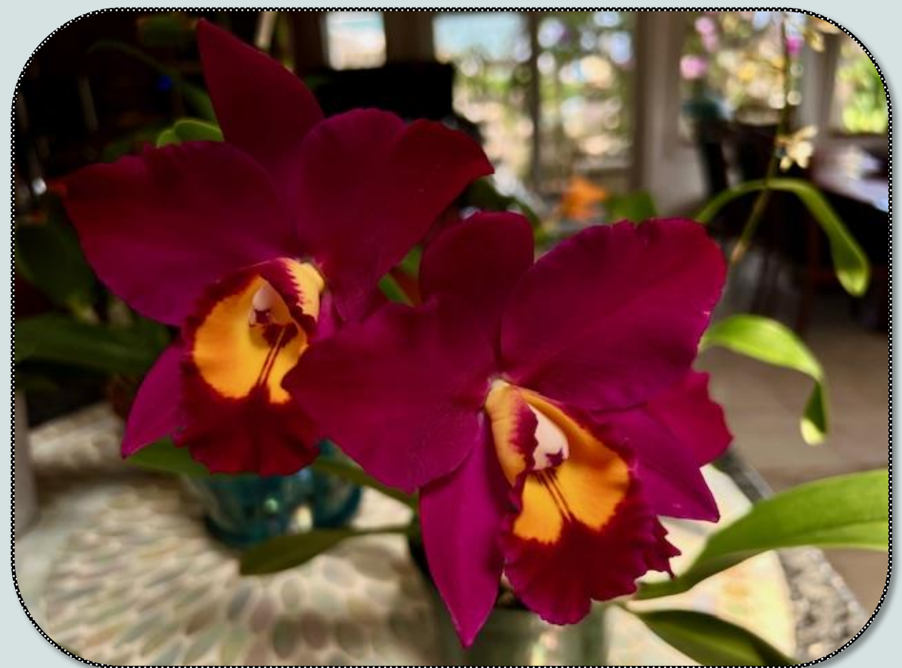
Pot. Hawaiian Prominence 'America'