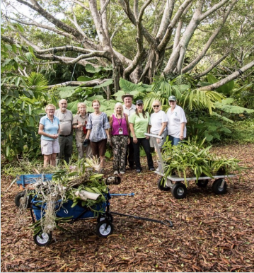
Volunteers from DBOS and Friends of the Arboretum