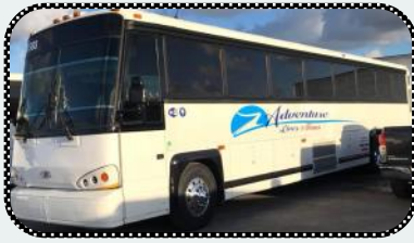
Annual Bus Trip to Growers