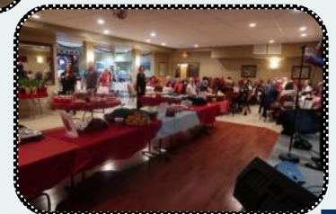
Annual Holiday Party