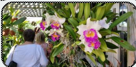
Annual Home Ramble