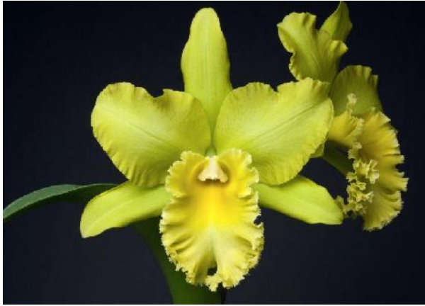
Rlc Prada Green Deluxe "Liams Lizard" AM/AOS