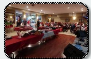
Annual Holiday Party