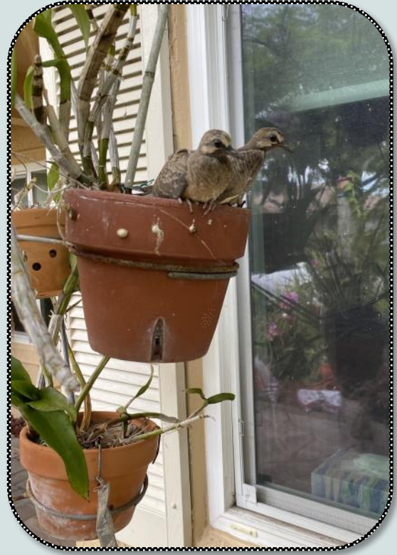
Baby Doves right before leaving the nest on March 30.