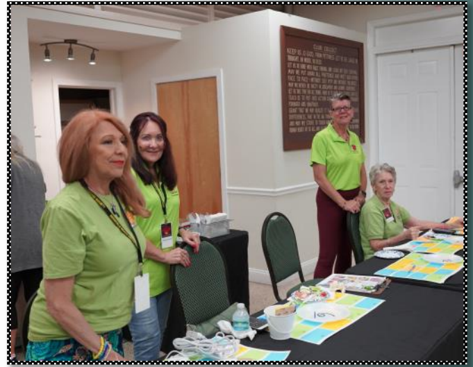
Auction Bid Accounting Clerks