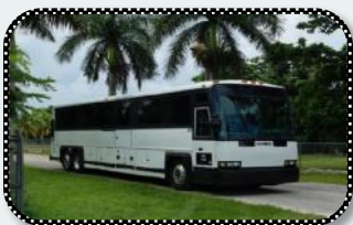
Annual Bus Trip to Growers