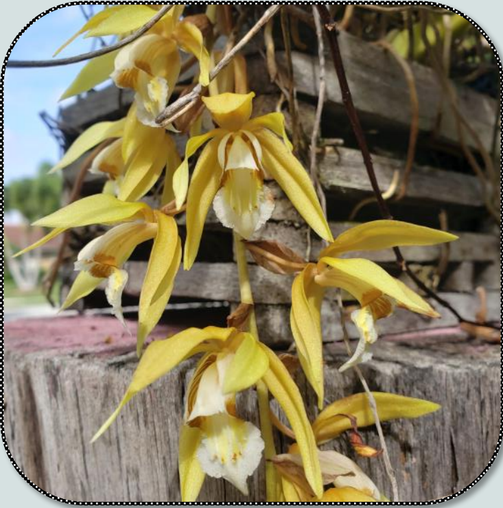
Coelogyne rochussenii species