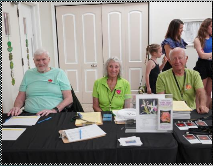
Auction Registration Sign-in Desk