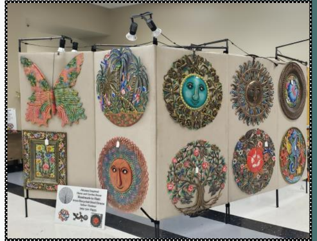
Atizana Inspired https://atizanainspired.com/