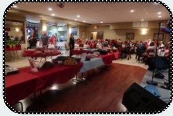
Annual Holiday Party