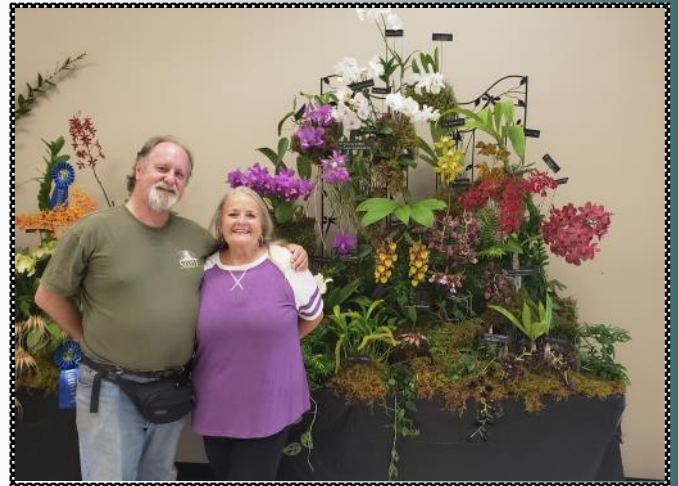
Jim-N-I Orchids, Homestead, FL Best Vendor Table Display: This stunning table display won the AOS award. Best Catasetum: Catasetum Dreamboat