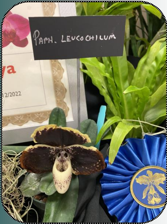
Best Paphiopedilum: Paph. Leucochilum Odom's Orchids, Fort Pierce, FL. https://odoms.com/