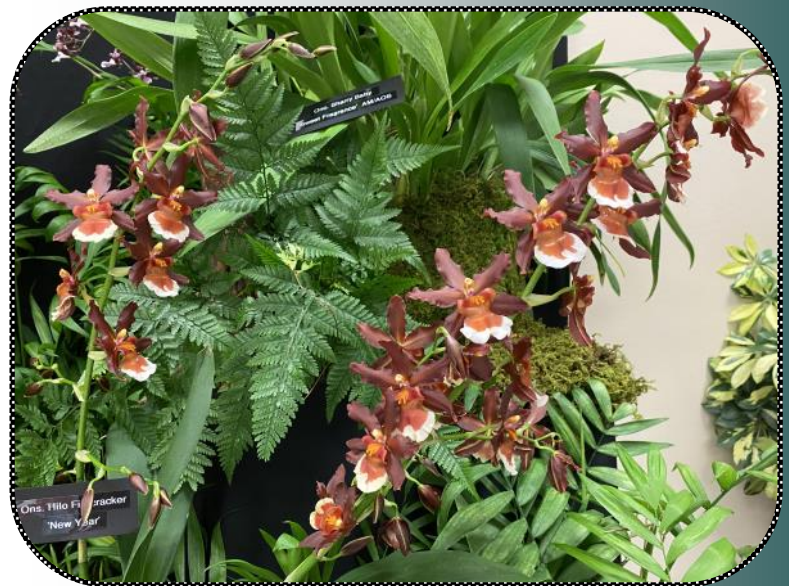
Best Oncidium: Onc. Hilo Firecracker 'New Year' Bredren Orchids, Apopka, FL.