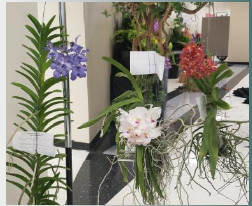
Local Hobbyists Orchid's Table for AOS Judging