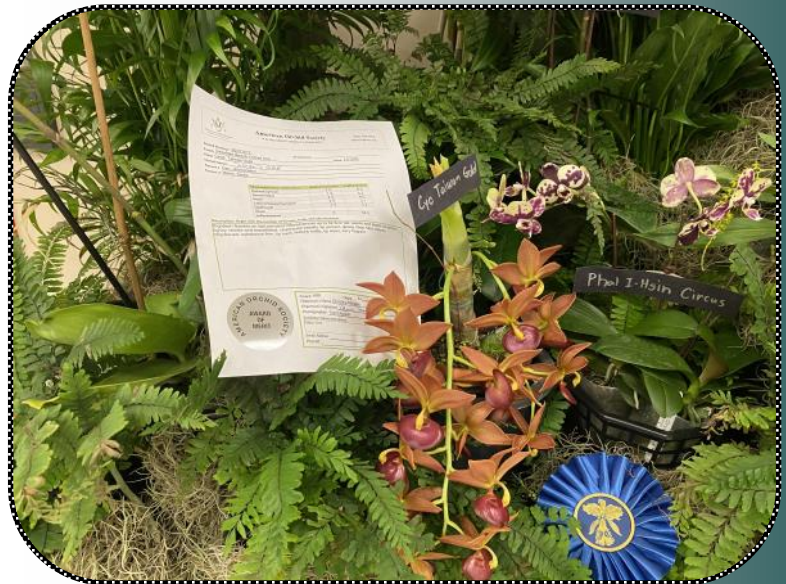
AOS Award of Merit: Cynodes Taiwan Gold Ritter's Tropic I Orchids, Kissimmee, FL. www.rittertropic1.com/