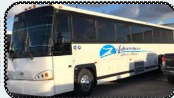
Annual Bus Trip to Growers