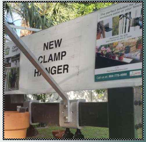
BACTRA Plant Stand Factory www.PlantStandFactory.com