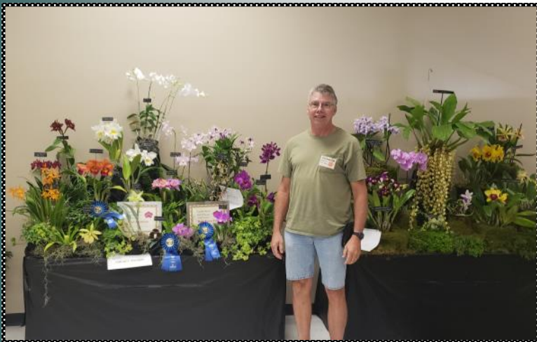
Odum's Orchids, Fort Pierce, FL Best Cattleya: Pot. Odom's Orange Dream Best Encyclia: Encyvola Dawn Henry Best Paphiopedilum: Paph. Leucochilum