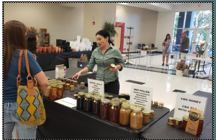
Liquid Gold Raw Honey https://liquidgold.store/