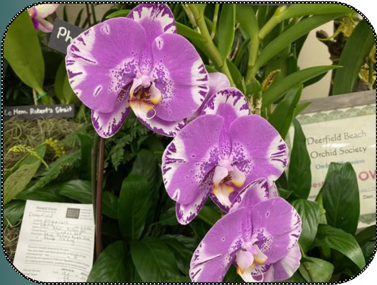
Best in Show: Phalaenopsis Fuller's 3545 Ritter's Tropic I Orchids, Kissimmee, FL.