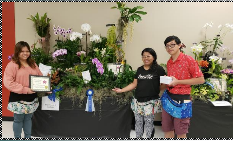
Ritter's Tropic I Orchids, Kissimmee, FL Best Phalaenopsis: Phal. Fuller's 3545 AOS Award of Merit: Cycnodes Taiwan Gold