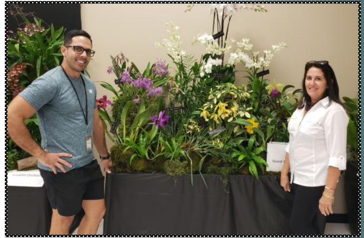
Quest Orchids Miami, FL