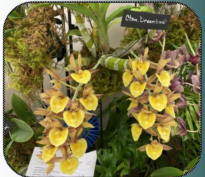
Best Catasetum: Catasetum Dreamboat Jim-n-I Orchids, Redland, FL.