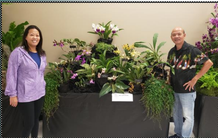
So Orchids Lakeland, FL