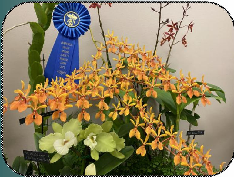
Best Vandaceous: Renanthera Kalsom 'Midas Kiss' Krull-Smith Orchids, Apopka, FL. https://www.krullsmith.com/