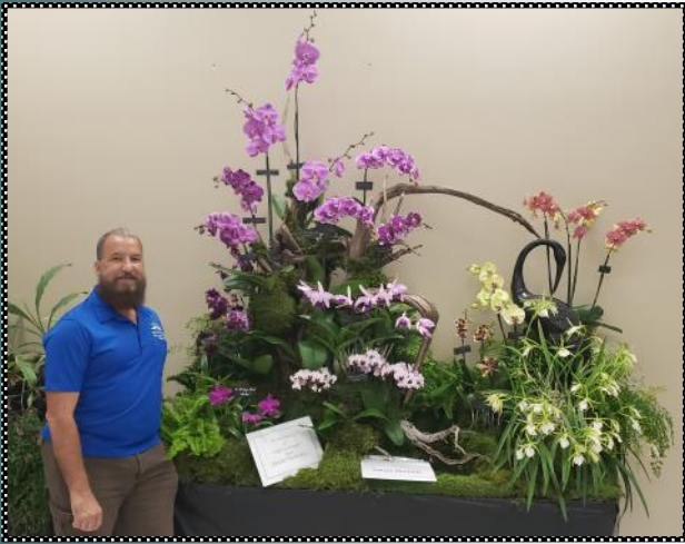
Soroa Orchids Homestead, FL