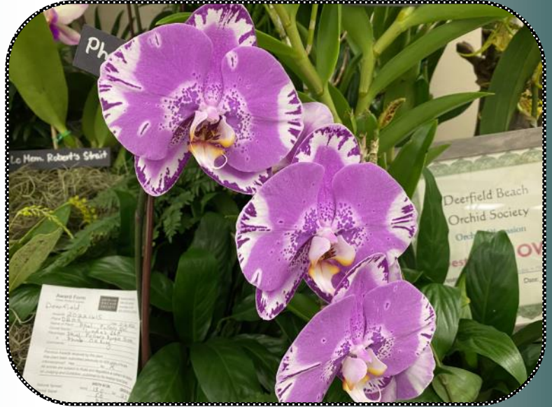
Best Phalaenopsis: Phal. Fuller's 3545 Ritter's Tropic I Orchids, Kissimmee, FL. www.rittertropic1.com/