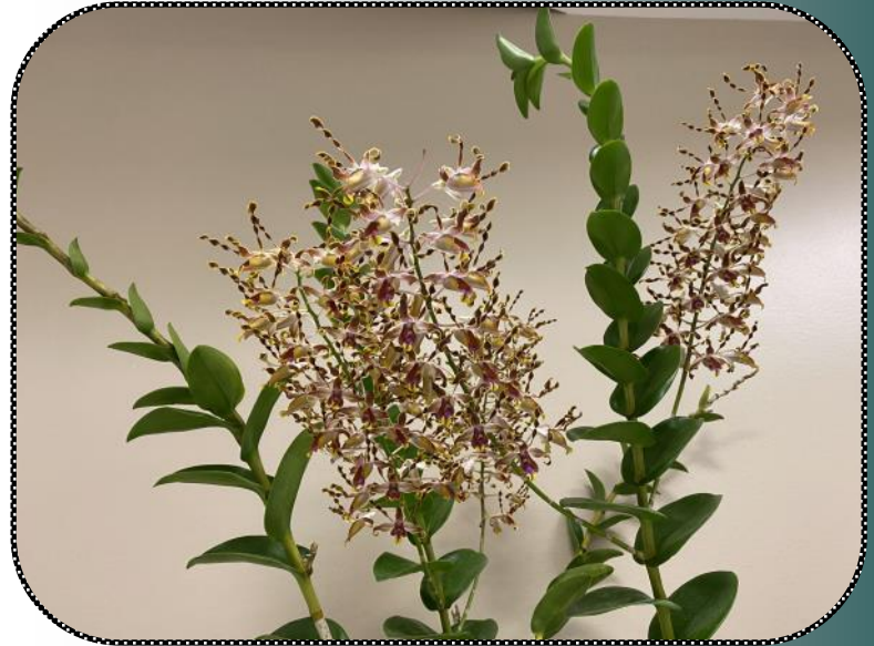
Best Dendrobium: Den. lasianthera 'Krull's Summer Sunset' Krull-Smith Orchids, Apopka, FL.