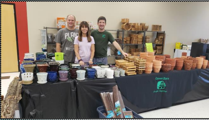
Green Barn Orchid Supplies www.greenbarnorchid.com