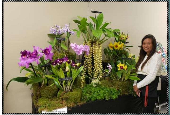
Orchids in Bloom Apopka, FL