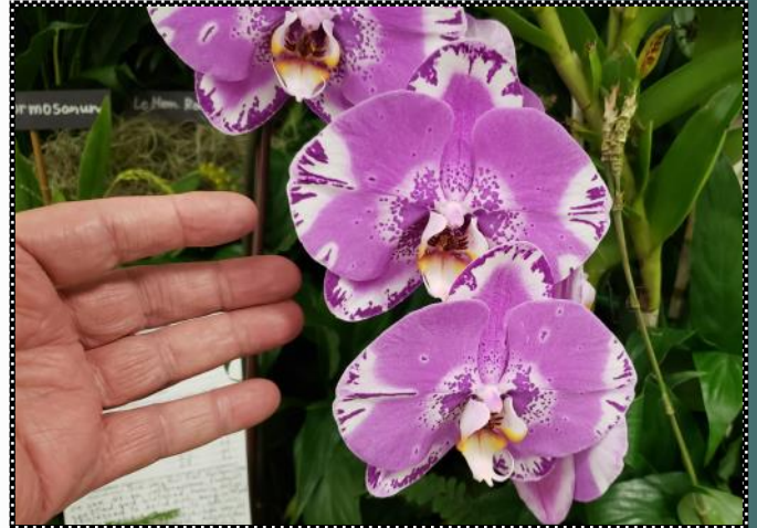
Ritter's Tropic I Orchids, Kissimmee, FL Best in Show: Phalaenopsis Fuller's 3545