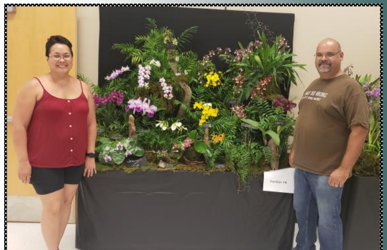
Bredren Orchids, Apopka, FL Best Oncidium: Ons. Hilo Firecracker 'New Year'