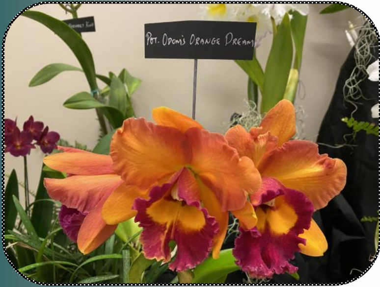
Best Cattleya: Pot. Odom's Orange Dream Odom's Orchids, Fort Pierce, FL.