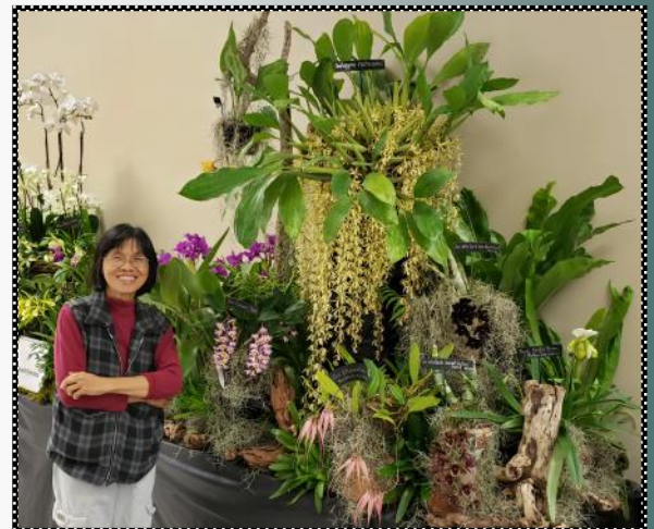
Smiley's Orchids Clermont, FL