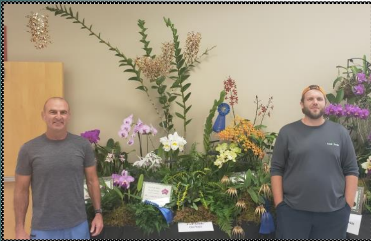
Krull-Smith Orchids, Apopka, FL Best Dendrobium: Den. lasianthera 'Krull's Summer Sunset' Best Vandaceous: Renanthera Kalsom 'Midas Kiss' Best Bulbophyllum: Bulbophyllum Elisabeth Ann