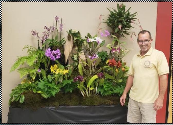
Mac's Orchids Southwest Ranches, FL.