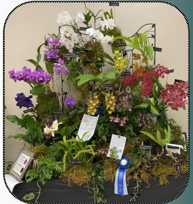
Best Vendor Table Display: This stunning table display by Jim-n-I Orchids, Redland, FL, won the AOS award.