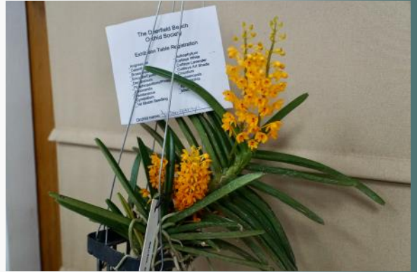
Ascocentrum garayi BLUE Ribbon Cheryl Babcock