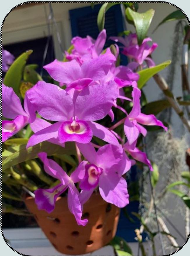
Tristan Fitch crown fox Grace and Bill Holliday