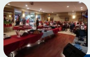
Annual Holiday Party