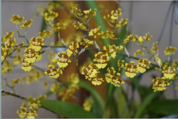
Oncidium sphacelatum BLUE Ribbon Cindy Rostock