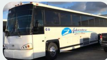
Annual Bus Trip to Growers