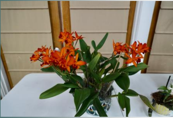
Laeliocattleya Fire Dance 'Blanche' BLUE Ribbon Grace Holliday