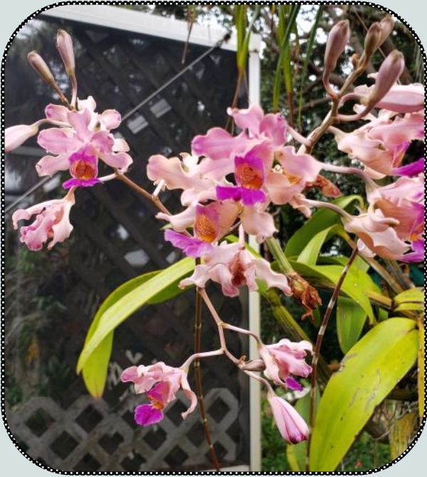
Myrmecocattleya Stephanie & Terry Morkert